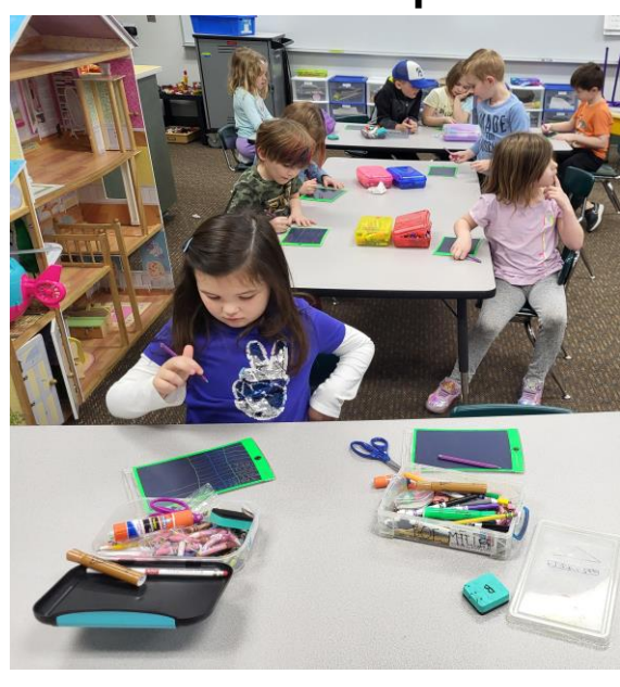
Kindergarten students using Boogie Boards in class to practice handwriting.