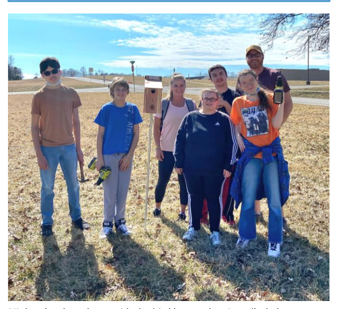
High school students with the bird house they installed along Norman's Bluebird Trail.

"My kiddos are so engaged when we practice writing words while using the Boogie Boards! It has been great not only during group work time but also during interventions. This has been a great tool to help kiddos during interventions to work on their skill gaps."